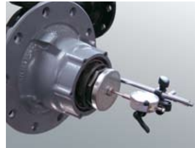
Fig. 3 - A typical endplay gauge.