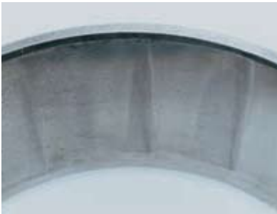
Fig. 1 - Outer race (cup) scalloping; uneven localized wear resulting from excessive endplay.

According to the National Transportation Safety Board, the incidence of wheel separations is about 750 to 1,050 per year. The Safety Board identified improper truck wheel maintenance as a potential cause. Most often cited were inadequate in-service inspection guidelines and failure to adhere to recommended maintenance practices. For your safety and the safety of everyone on the road, always follow recommended wheel-end inspection and maintenance guidelines.